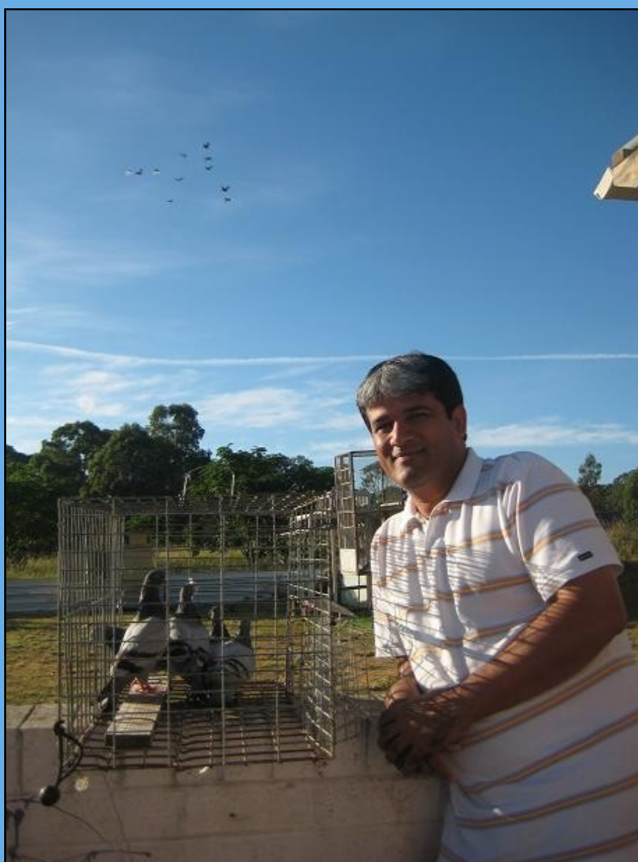
The Furious Five with a very proud Master Shi-Fu