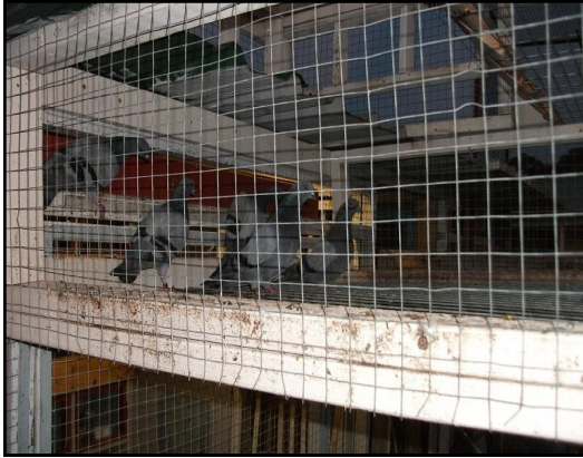
FURIOUS FIVE AT FIVE