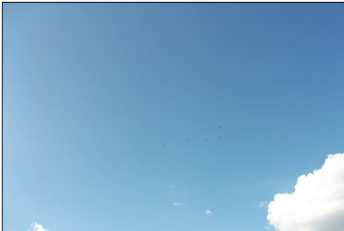
FURIOUS FIVE ON THE WAY TO SETTING THEIR RECORD FLY