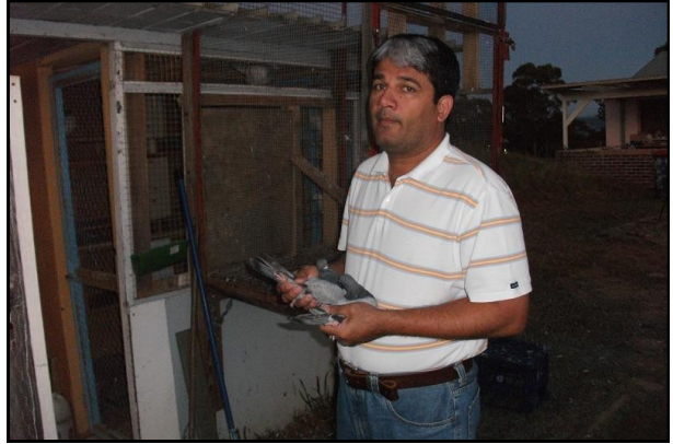
CHECKING RINGS PRIOR TO LIBERATION