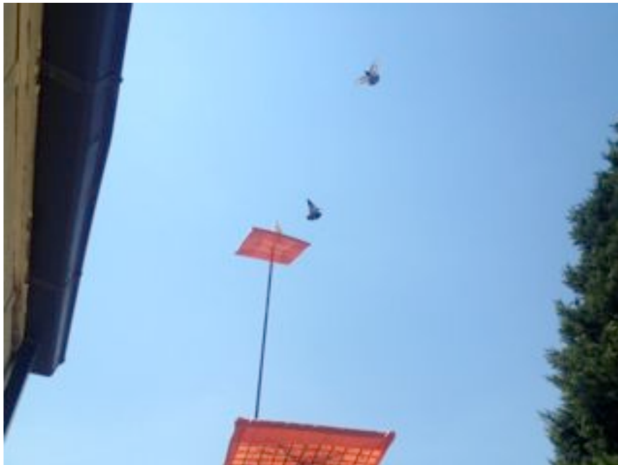
Lucky's birds just about to land.

Well done Lucky, nice to see you guys having fun and enjoying yourselves.