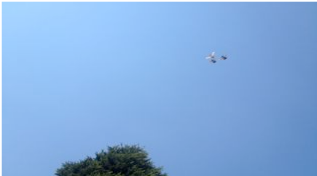
Lucky's Kit of three in the air.

Aman Sidhu (Lucky) also an AFTU member participated in an exhibition fly on the 17 th of February . He invited a few of the AFTU members over to his home to witness the fly. He flew a kit of three birds, he released the kit at 7am, the birds flew in a nice tight kit for over 4 hours when the Falcon decided to attack and chased one of the birds down into a tree. The other 2 kept flying and 20 minutes later the 3 rd one took off from the trees and joined the other two. At 11.55 am Lucky decided to drop them. The AFTU members present had a good time watching the kit fly and talking Tipplers. Here are some pictures of Lucky's birds in the air, as well as pictures of his birds dropping.