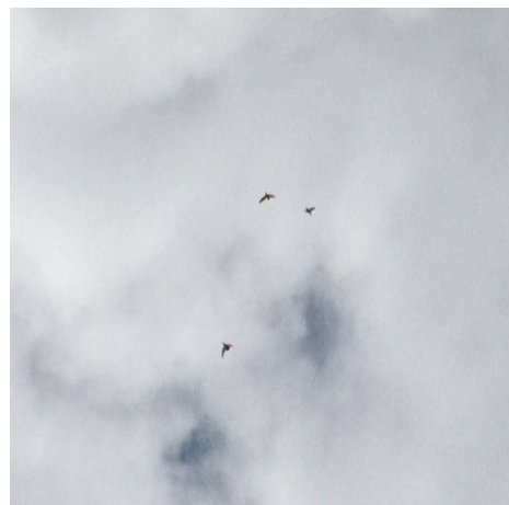
Phillip's kit in the air.