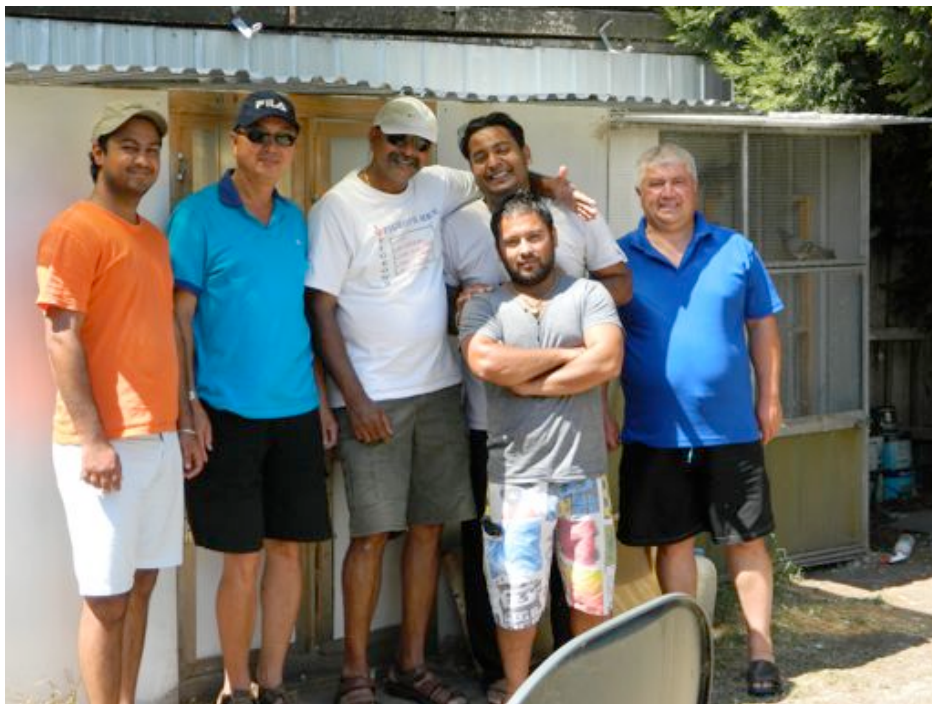
The AFTU boys at Lucky's home to witness the fly.