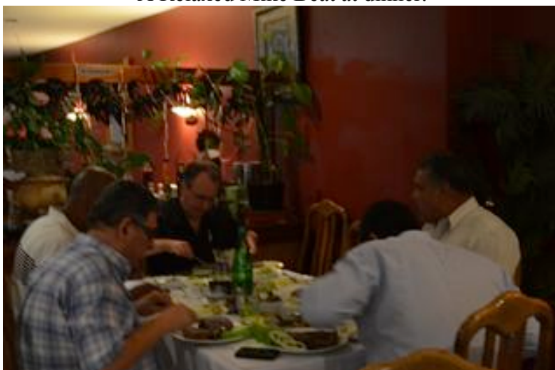
Everyone tucking in at dinner.