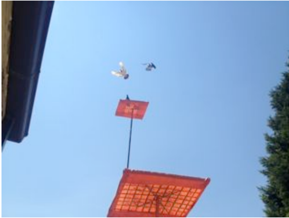
Lucky's birds landing.