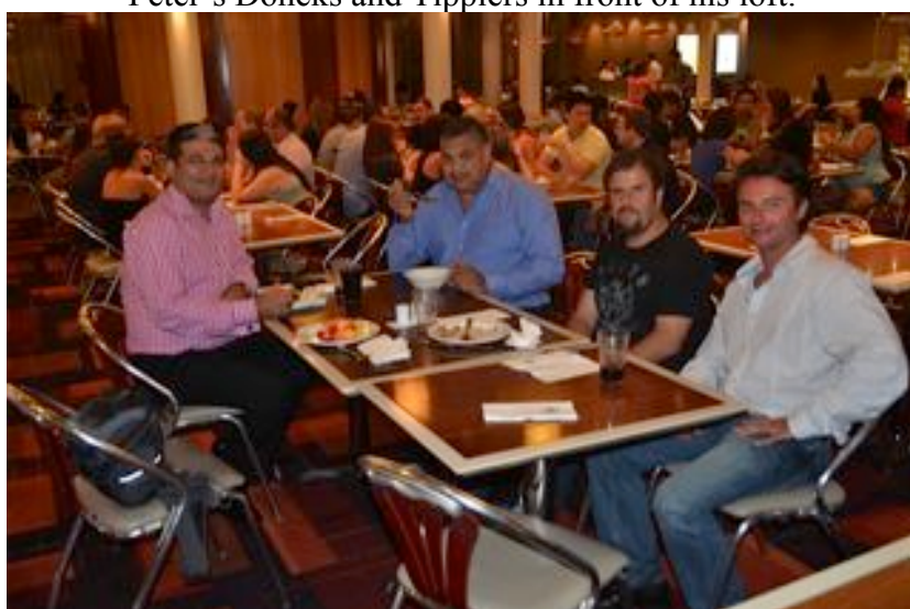
Some of the AFTU boys at the Casino the evening before meeting Mike Beat.