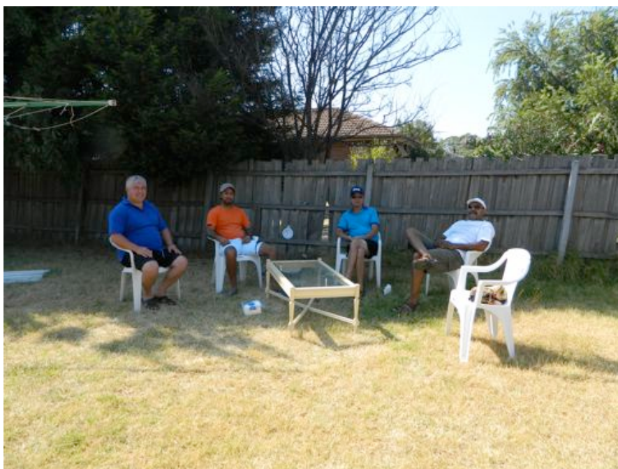
AFTU boys at Lucky's home on fly day.