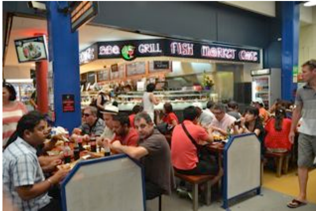
The gang at lunch at the Sydney Fish Markets.