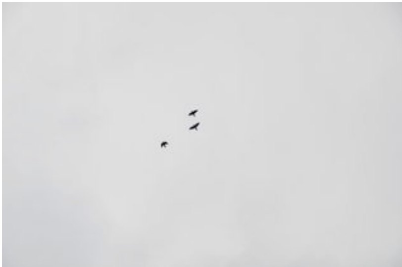
Frank's Kit of three blacks in the air.