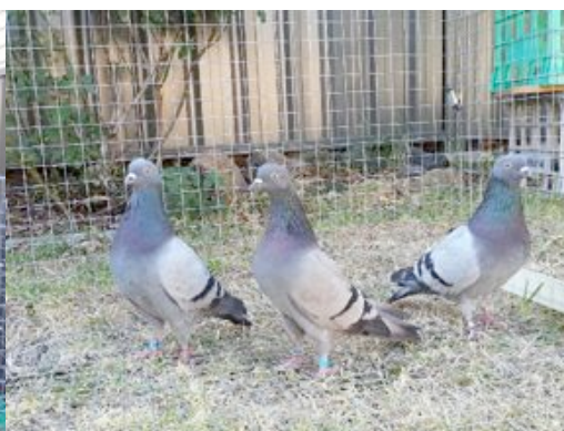
Phillip's kit of three blue bars.

CONGRATULATIONS PHILLIP - A GREAT ACHIEVEMENT !!